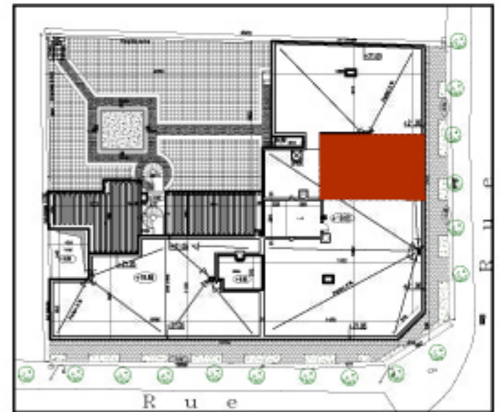
PLAN DE REPERAGE